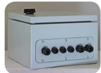
Configurable input/output glands for system connections